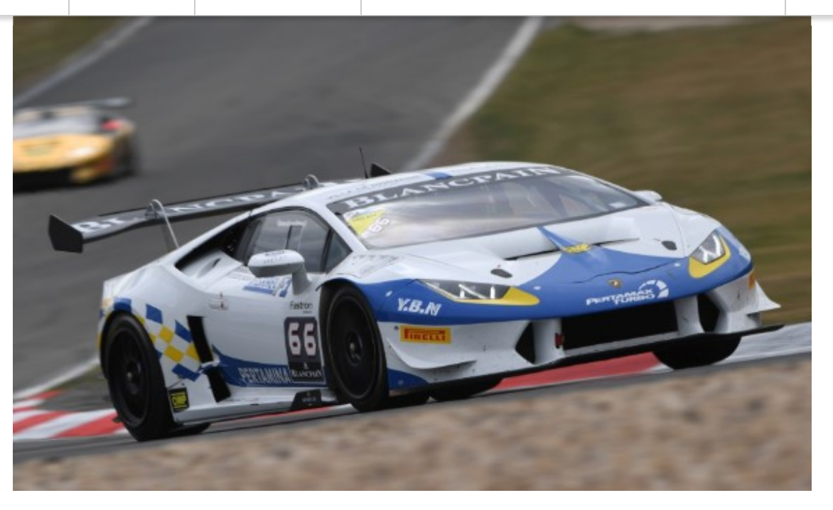
Baruch and Cozzolino won the Pro-Am category in race one

Qualifying for race one saw Cozzolino behind the wheel of the 66 car. The Italian driver set the 7th quickest time of the session and was fastest in the Pro-Am category. Krenzia was the 2nd fastest Am and claimed a starting place on row eleven.